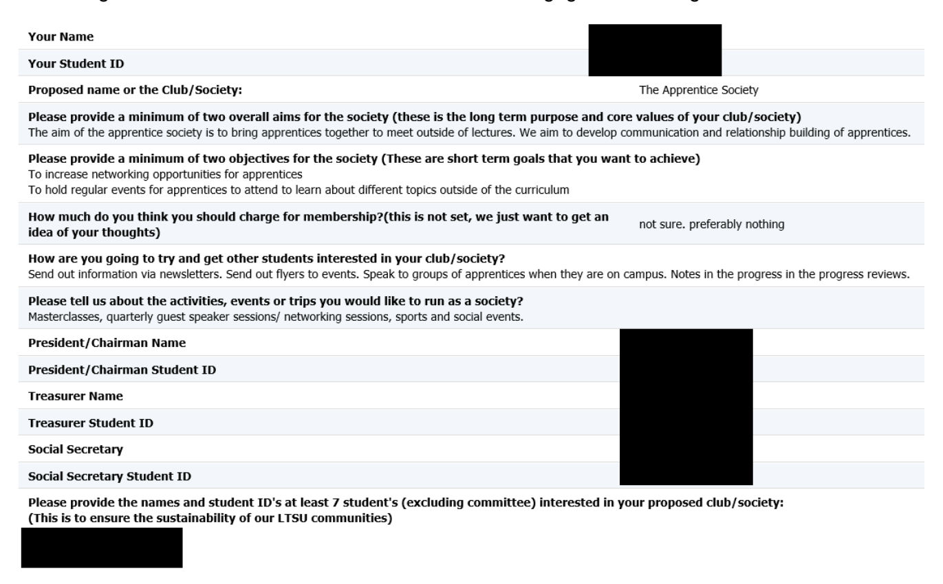
Item C: New applications for the Student Activities Committee funding

No meeting notes from the Activities Coordinator and the Engagement Manager available.